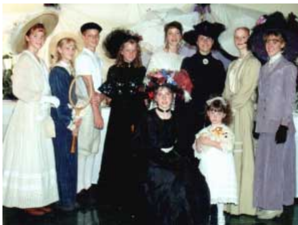
The Victorian Tea features a live Victorian Fashion Show. These are the models from last year, decked out in their vintage finery.

Simply call ahead to the museum at (208) 962-7123 or email museum@velocity.net and let us know how many are in your party and which seating you prefer. We will accept reservations until the day of the event.