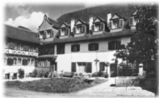
St. Andreas Kloster, Sarnen, Switzerland.