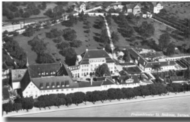
Aerial view of St. Andreas Kloster in Sarnen, Switzerland.