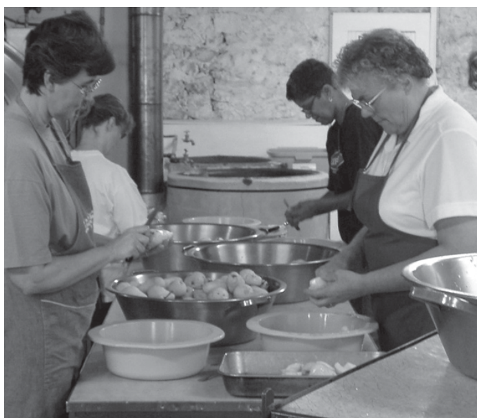
A donation of fresh pears prompts a canning party at the monastery.

We work hard to be good stewards of these gifts as well as the abundance from our gardens and fields. Each year we select fruits and vegetables from our gardens to enter in the Idaho County Fair.