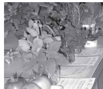
Monastery gardens yielded fresh produce for the county fair.

been made of a living presence in order for us to live. In the literal sense of the word, "sacrifice" means "to make something sacred". This is evident not only when we celebrate our Eucharist, but when we share meals with one another and our guests at our Earth's "table of plenty".